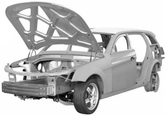
Figure 1. Example of a photograph figure and figure caption

For a schematic or qualitative data presentation, the axes should be identified and should be legible if printed on an 8.5"x11" or A4 size paper.